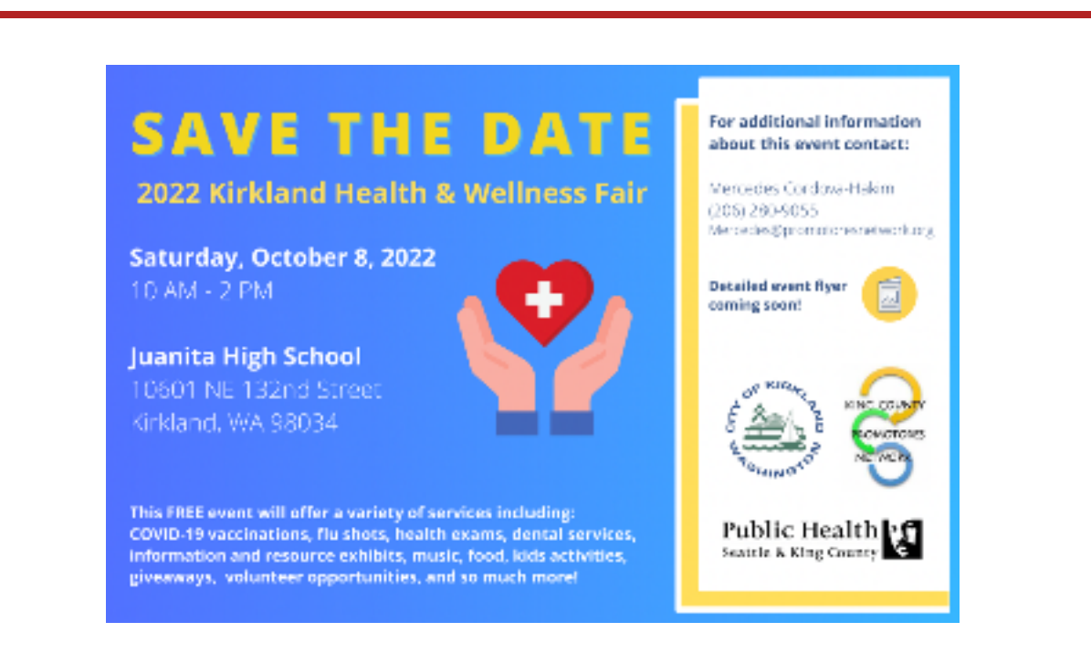
Kirkland Health Fair