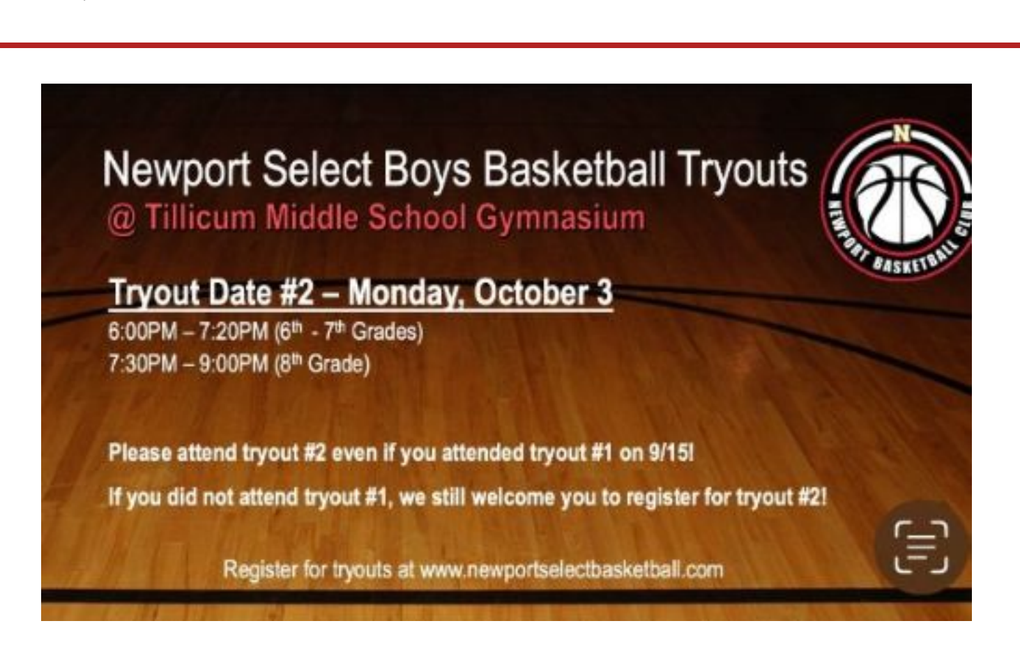
Newport Select Boys Basketball Tryouts

The International School PTSA will be hosting a Goodwill Drive on Saturday, October 1st, 2:00 PM–5:00 PM. Clothes, shoes, household items, small electronics, books, toys, sporting goods, and accessories can be collected. Please no large furniture. Goodwill is also a certified e-waste recycler, so they will take computers, peripherals, televisions, monitors, and other e-waste.